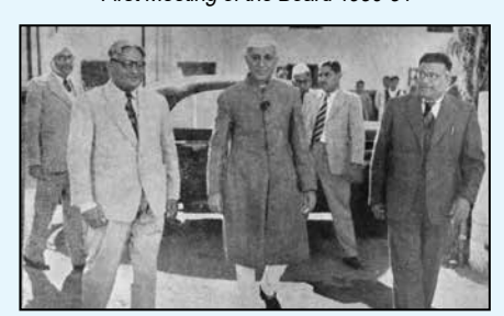
The then Prime Minister of India, Late Pandit Jawahar Lal Nehru arriving to inaugurate the Silver Jubilee Session of the CBIP in 1952