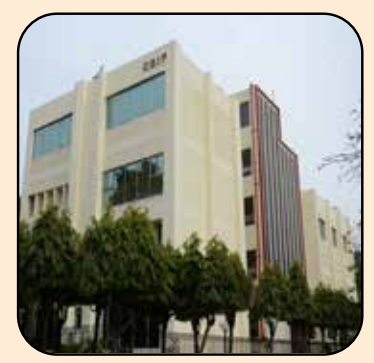
CBIP office at Chanakyapuri, New Delhi (1980 onwards)